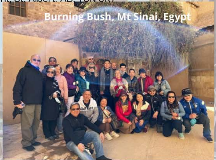
Burning Bush, Mt Sinai, Egypt