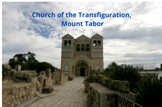
Church of the Transfiguration, Mount Tabor

LIABILITY : TCBTT- Marianatha Tours is a travel agency and has made the advertised holiday arrangements with the airline/s/, hotel/s/, cruise ship/s/, other operator/s/ and other. Each of these organizations has its own specific terms and conditions for doing business and you will be bound by them. TCBTT- Marianatha Tours accepts no responsibility for /A/ the acts or omissions of any party/ies/ other than TCBTT- Marianatha Tours employees./B/ failure by the passenger to be properly documented; /C/ failure by the passenger to comply with departure or joining or baggage requirements; /D/ aircraft delays, government actions, act/s/ of God or any factor beyond our direct control; /E/ cancellation or delay to any tour or holiday or change to the itinerary; /F/ expenses resulting from lost or damaged baggage. TCBTT- Marianatha Tours reserves the right to refuse any person as a member of these tours at its sole discretion.