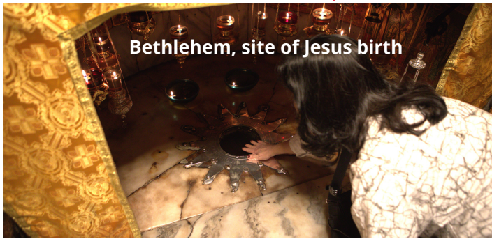
Bethlehem, site of Jesus birth