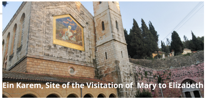
Ein Karem, Site of the Visitation of Mary to Elizabeth