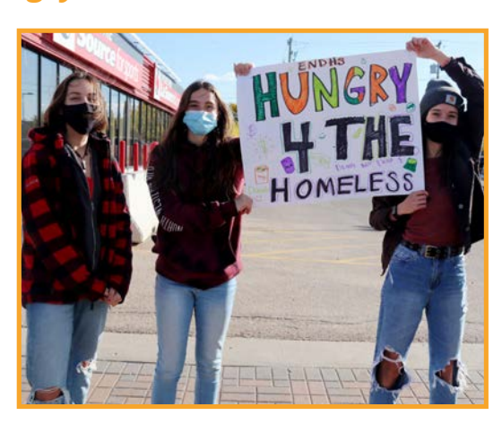
Click <u>here</u> for more stories from the Lakeland Catholic School Division.

Students stood in high-traffic areas of our community to collect donations of food and funds, all the while reflecting on the people they were raising the money for, some of the local community's most vulnerable.