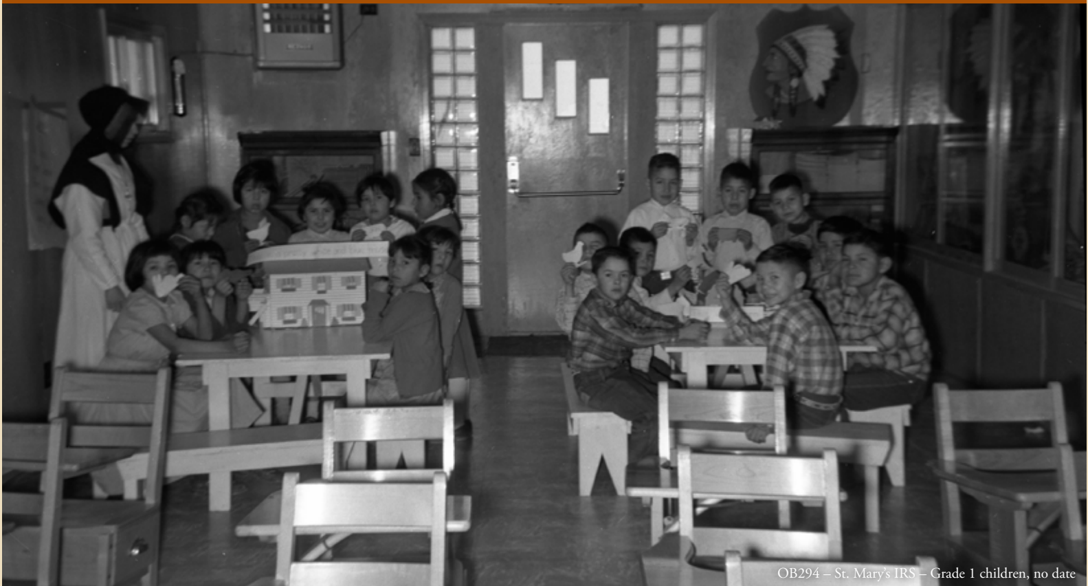
OB294 – St. Mary's IRS – Grade 1 children, no date