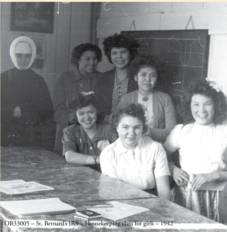
OB33005 – St. Bernard's IRS – Housekeeping class for girls – 1942