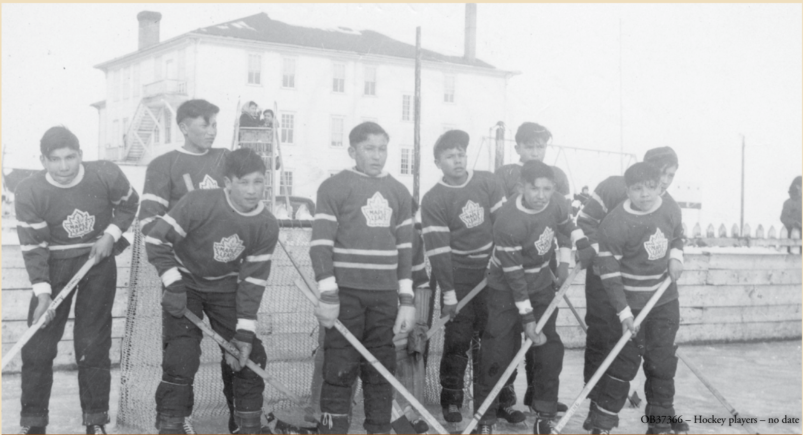
OB37366 – Hockey players – no date